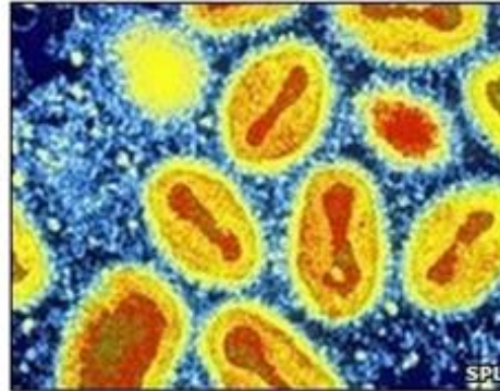
By 1980 smallpox had been eradicated