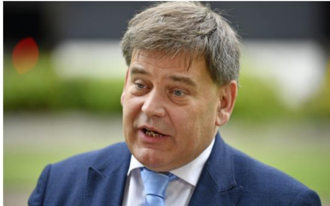
Tory MP Andrew Bridgen's comments were condemned as disgraceful