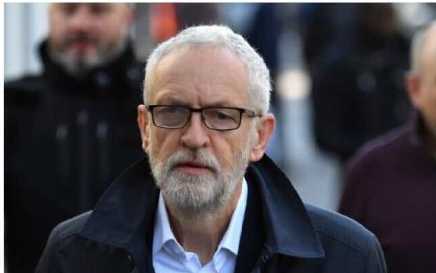
UK opposition Labour party leader Jeremy Corbyn leaves his residence in north London on October 28, 2019.

British Labour leader Jeremy Corbyn has been accused by a party branch of personally engaging in anti-Semitic acts on nine occasions.